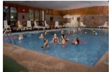
Heated Indoor Pool