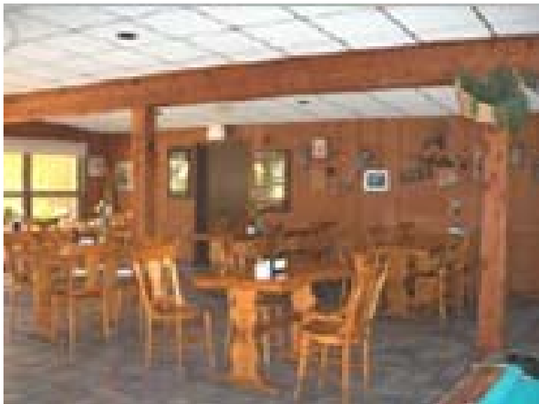
The Patio Café Coffee Shop