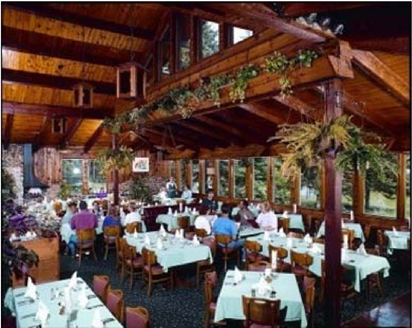
The Three Coins Restaurant with Chef Tom. Enjoy the flavor of the Northwoods in a welcoming free atmosphere of rough-sawn pine, waterfall and expansive windows to view the Northwoods and wildlife.